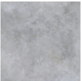
Béton Iron BN002