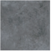
Béton Harbor BN004