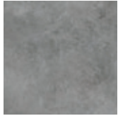
Béton Steel BN003