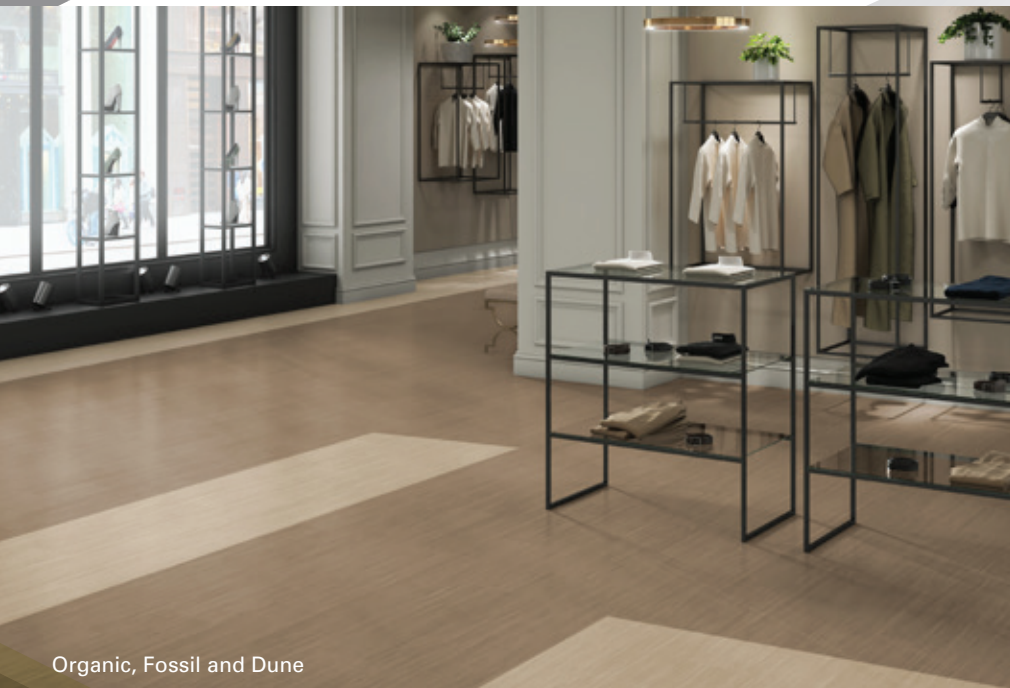
Organic, Fossil and Dune