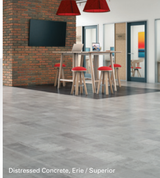
Distressed Concrete, Erie / Superior