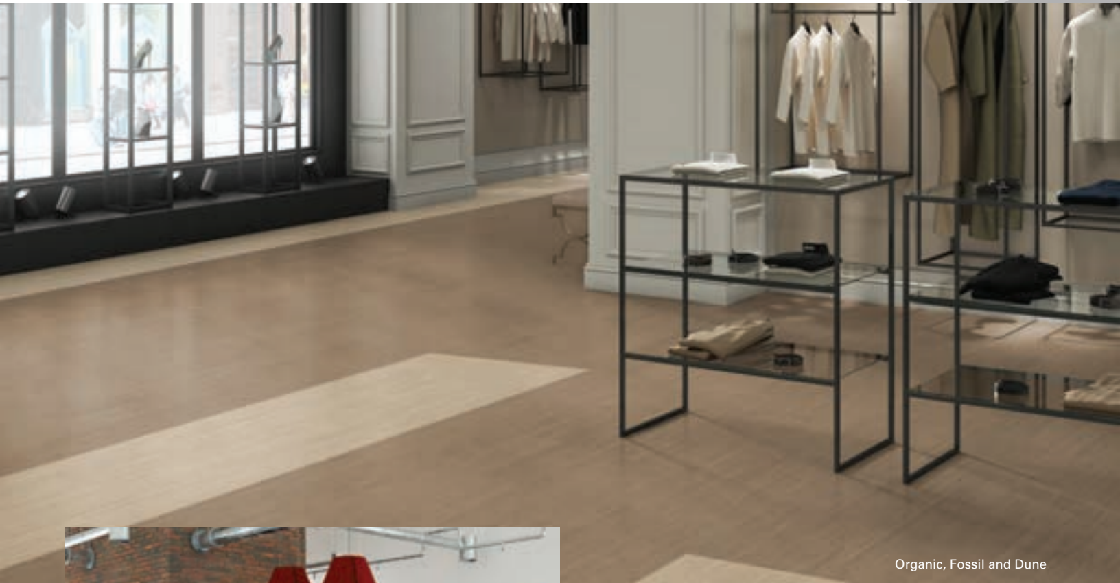
Organic, Fossil and Dune