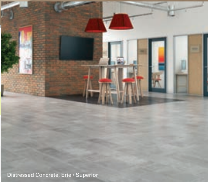
Distressed Concrete, Erie / Superior

The AVA ® MRGE ™ collection features four distressed concrete colorways and four modern concrete colorways, plus 10 delicately blended organic styles in earth tone colorways for a total of 18 styles. MRGE's 2.5mm 22mil wear layer construction provides superior performance in the toughest commercial settings including Hospitality, Corporate and Retail.