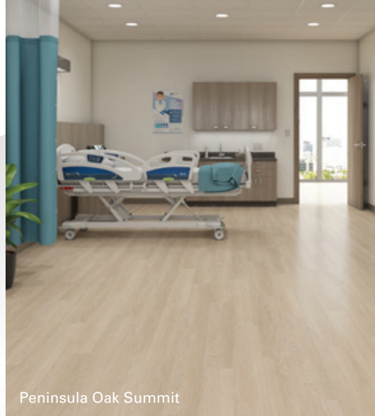
Peninsula Oak Summit