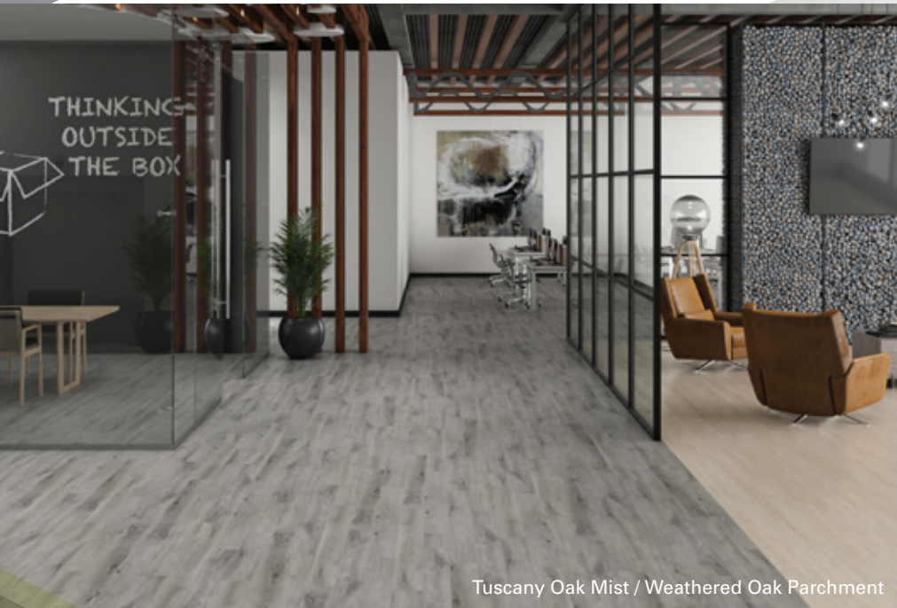
Tuscany Oak Mist / Weathered Oak Parchment