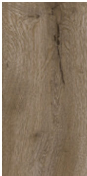
Tuscany Oak Peanut TO2D008