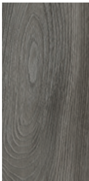
Alpine Oak Anchor AO2D009