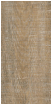
Weathered Oak Kona SO2D003