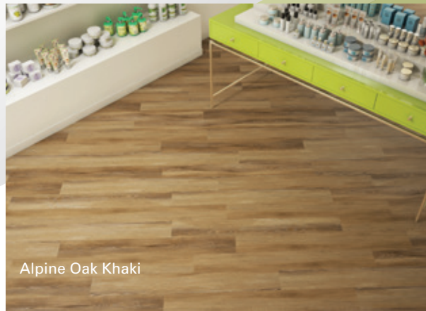
Alpine Oak Khaki